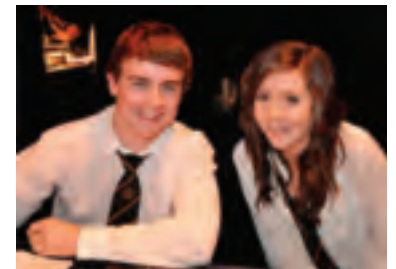
Àrdsgoil an Òbain, a bha a' gabhail pàirt san fharpais airson a' chiad uair