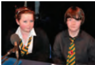
Acadamaidh Grange, Cill Mhearnaig, a bha a' gabhail pàirt san fharpais airson a' chiad uair Grange Academy, Kilmarnock participating in the competition for the first time